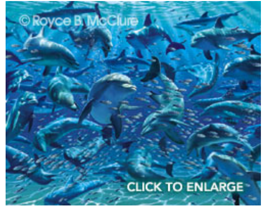
Fun with Dolphins